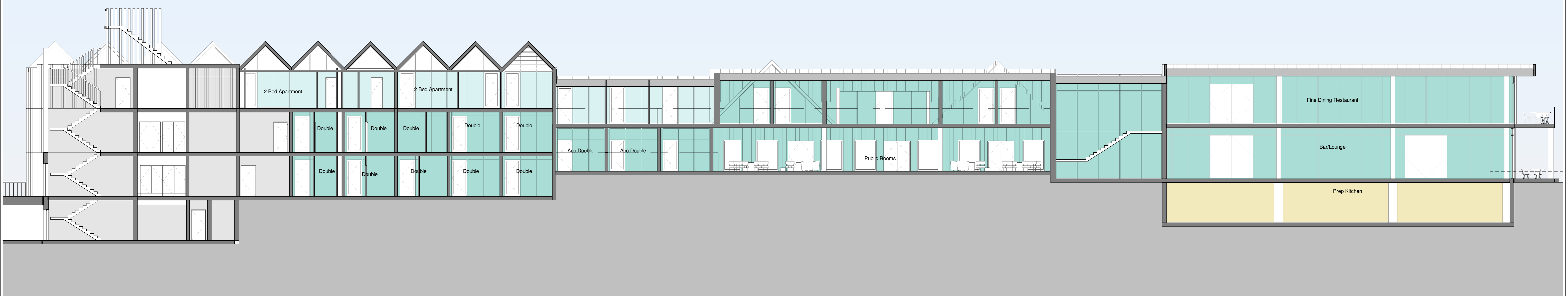
Section AA 1 : 100