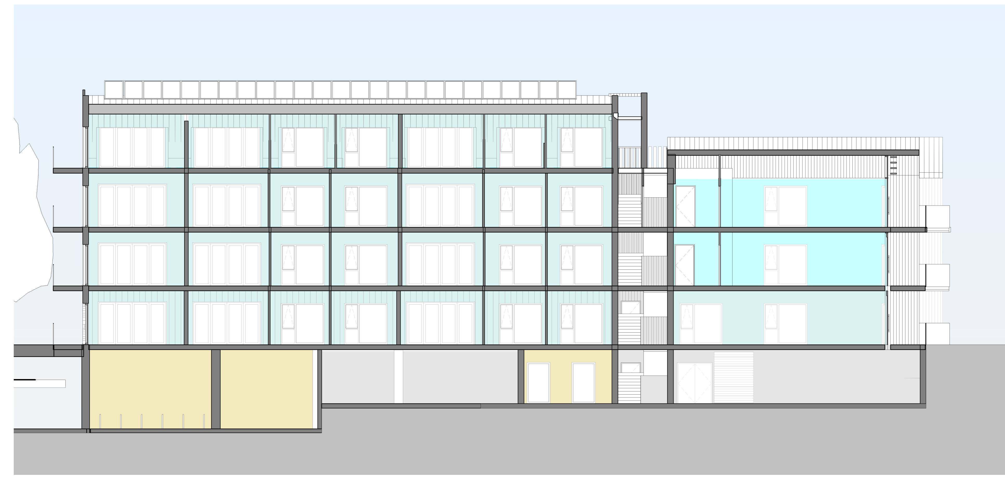
Section BB 1 : 100