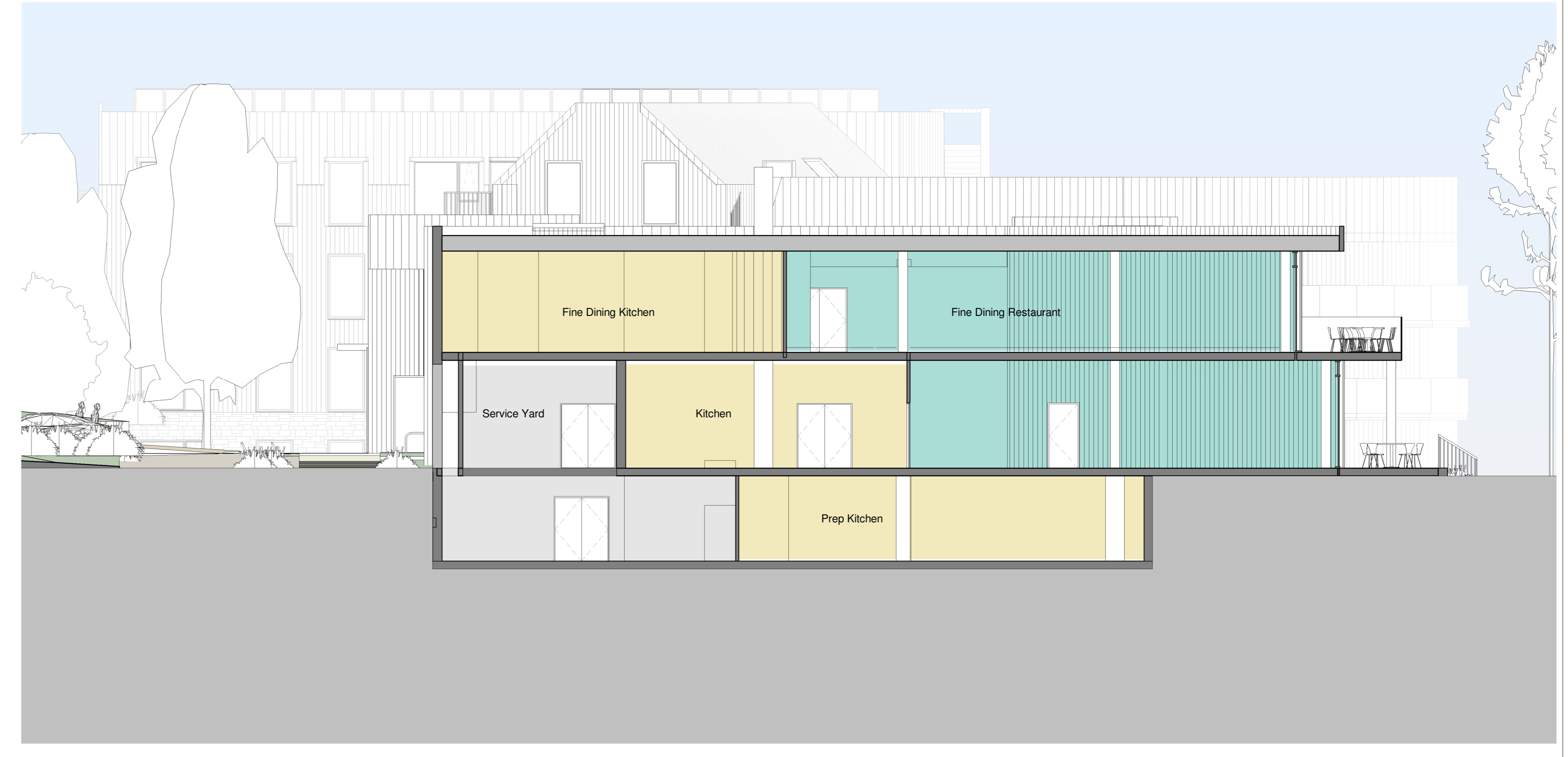
Section CC 1 : 100